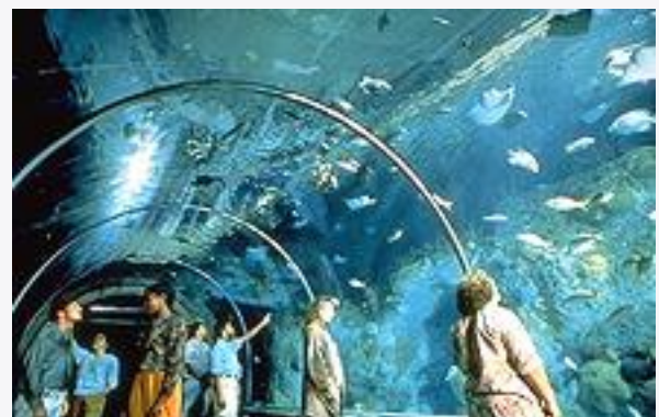
Aqua tunnel at the Aquarium of the Americas, New Orleans.